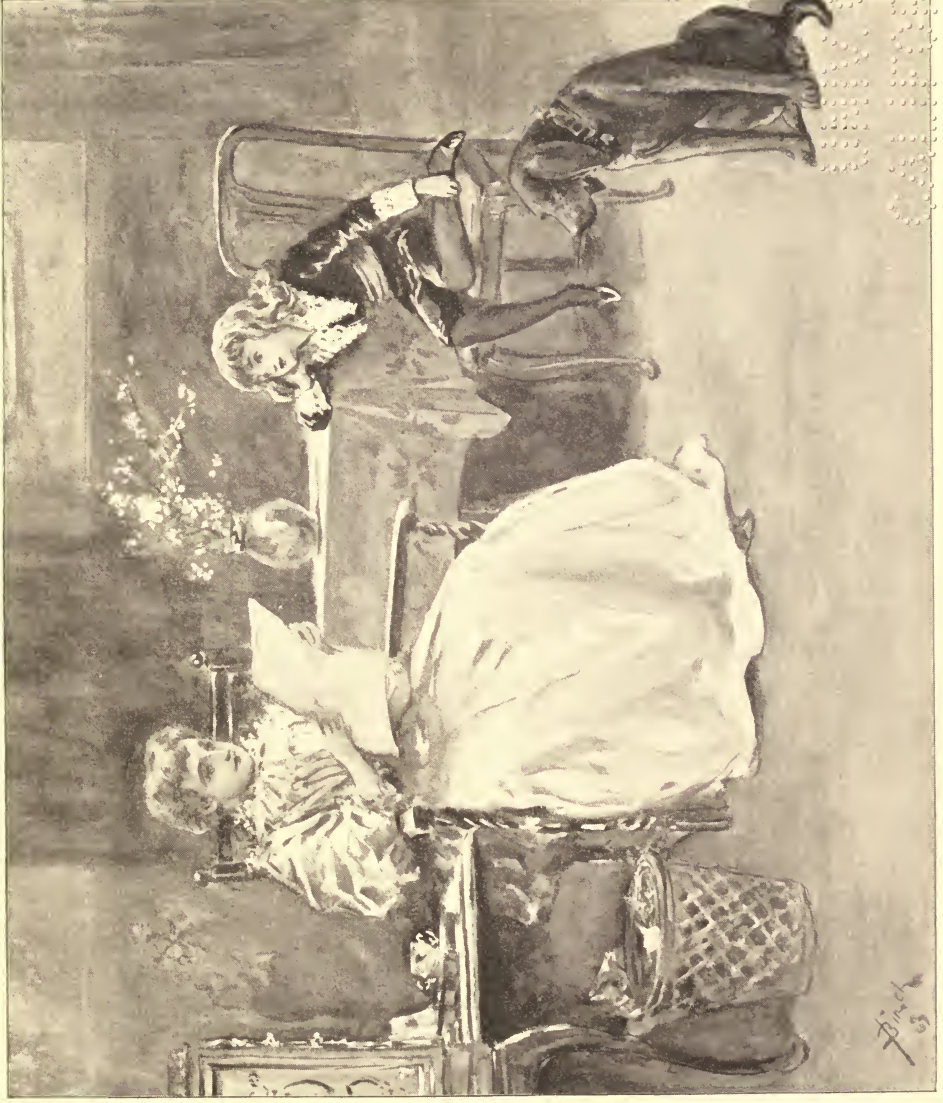
THE REAL FAUNTLEROY LISTENING TO THE STORY OF THE IDEAL FAUNTLEROY